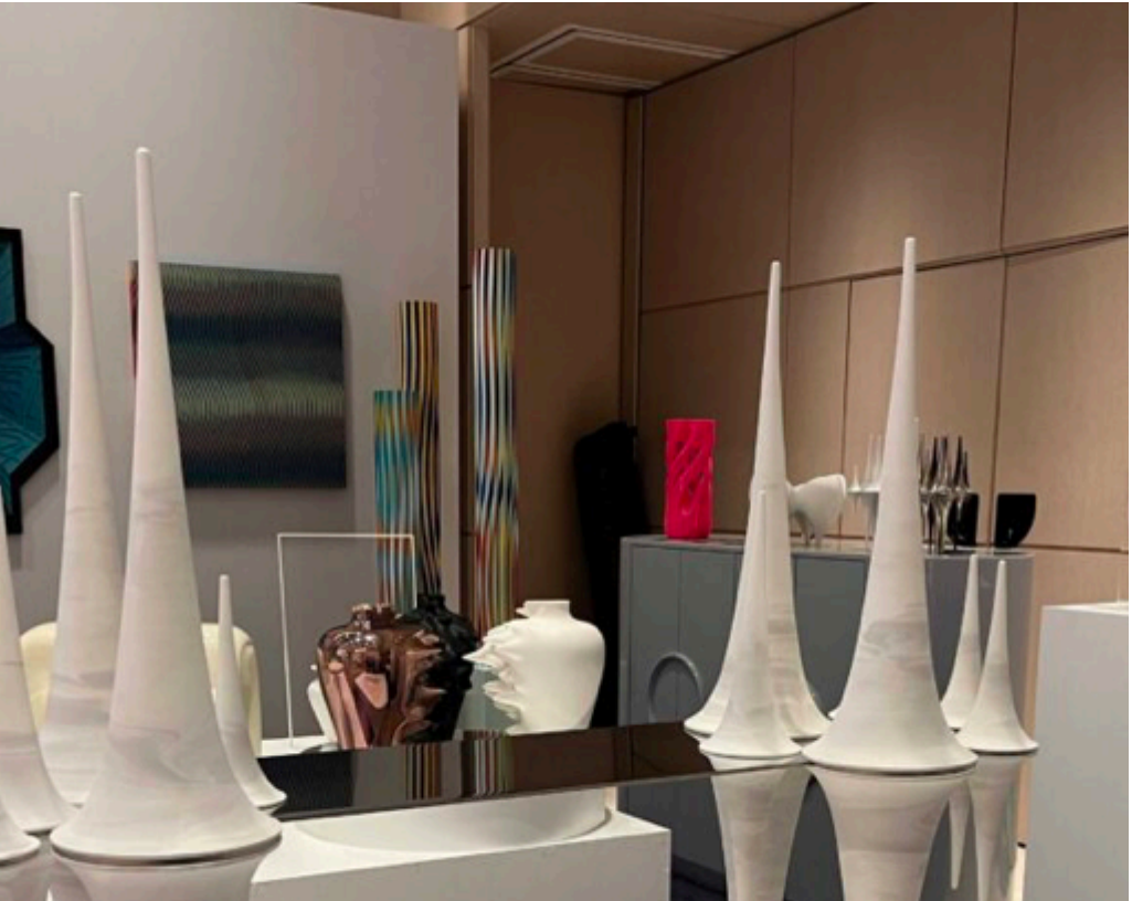
The Pseudospheres console