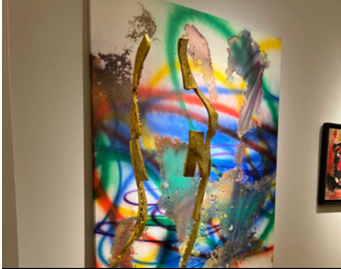
A bronze sculpture by Boky Hackel-Ward