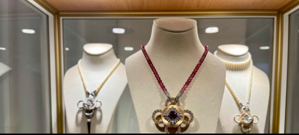
Some creations from the Rouvenat maison